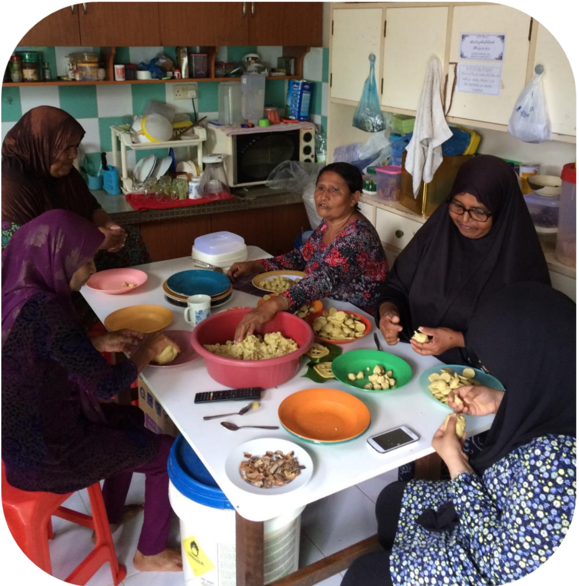
Women from Naifaru preparing baitfish based product for to sell locally

wellbeing of the communities of which they are a part and make sure that those participating in these tuna fisheries are recognised and adequately represented in decision-making.