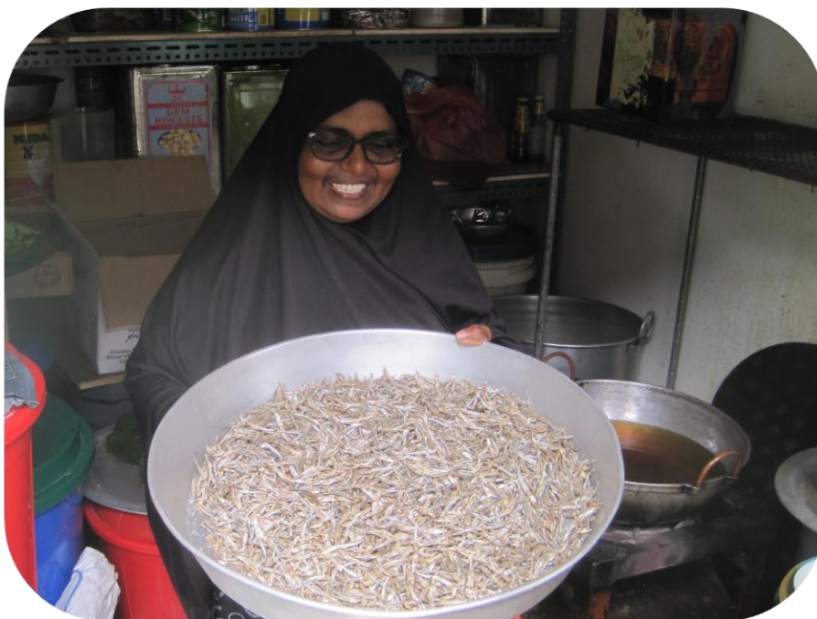
Woman from the Naifaru preparing tuna-based products to sell locally

In addition to the direct fishery-oriented roles women are playing in Naifaru's one-by-one tuna fisheries, there are also many informal roles that women take on that go unreported. For example, it is not uncommon for fishing crews to venture far from their home island in search of fish schools and this may require stopping at another island for repairs or fuel. Women will cook, clean and provide other hospitality services to these visiting crews, which while not playing a formal 'role' in the fishery is an indispensable activity. This underscores the extent to which women are a critical part of the Felivaru fishing industry and community, be it in more advanced roles like management or the more traditional roles like providing hospitality for visiting fishing crews. Their knowledge of the fishery and contribution to the fishery could have many implications for policy decisions if adequately understood and better utilised.