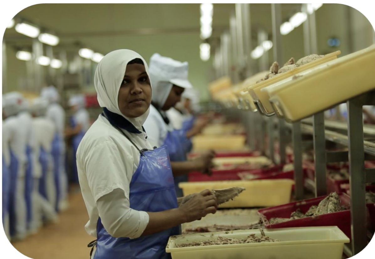
Female workers in a Maldivian cannery

Overall, a comprehensive and integrated approach should be taken to fill some of the data and information gaps that exist, particularly for coastal fisheries. The following section will describe the methodology applied to research on roles women are playing in pole-and-line and handline (one-by-one) tuna supply chains in Naifaru, Lhaviyani Atoll.