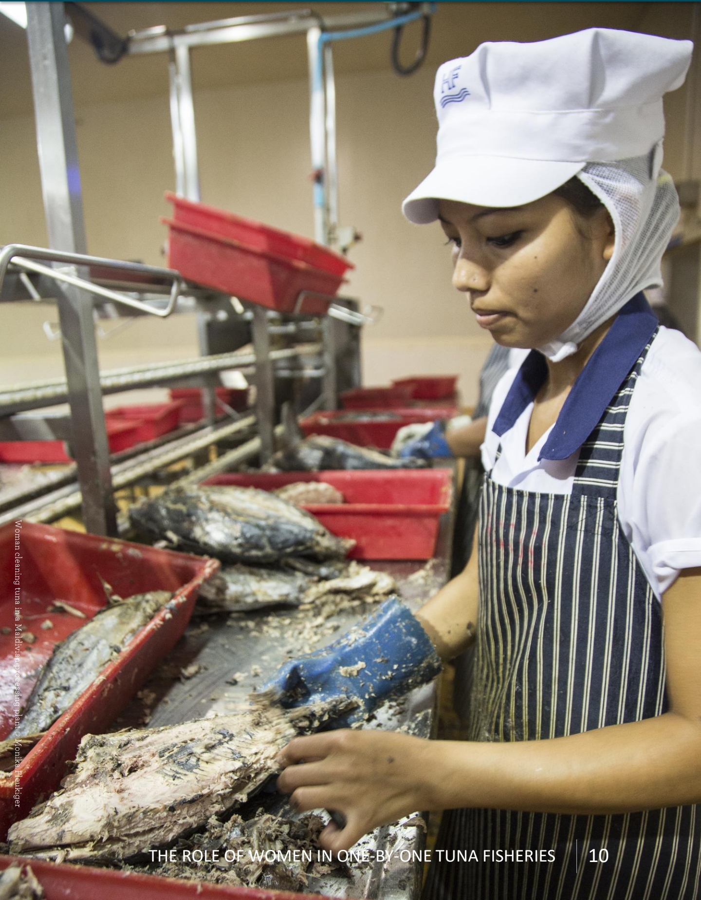
Woman cleaning tuna in the Maldivian processing plant