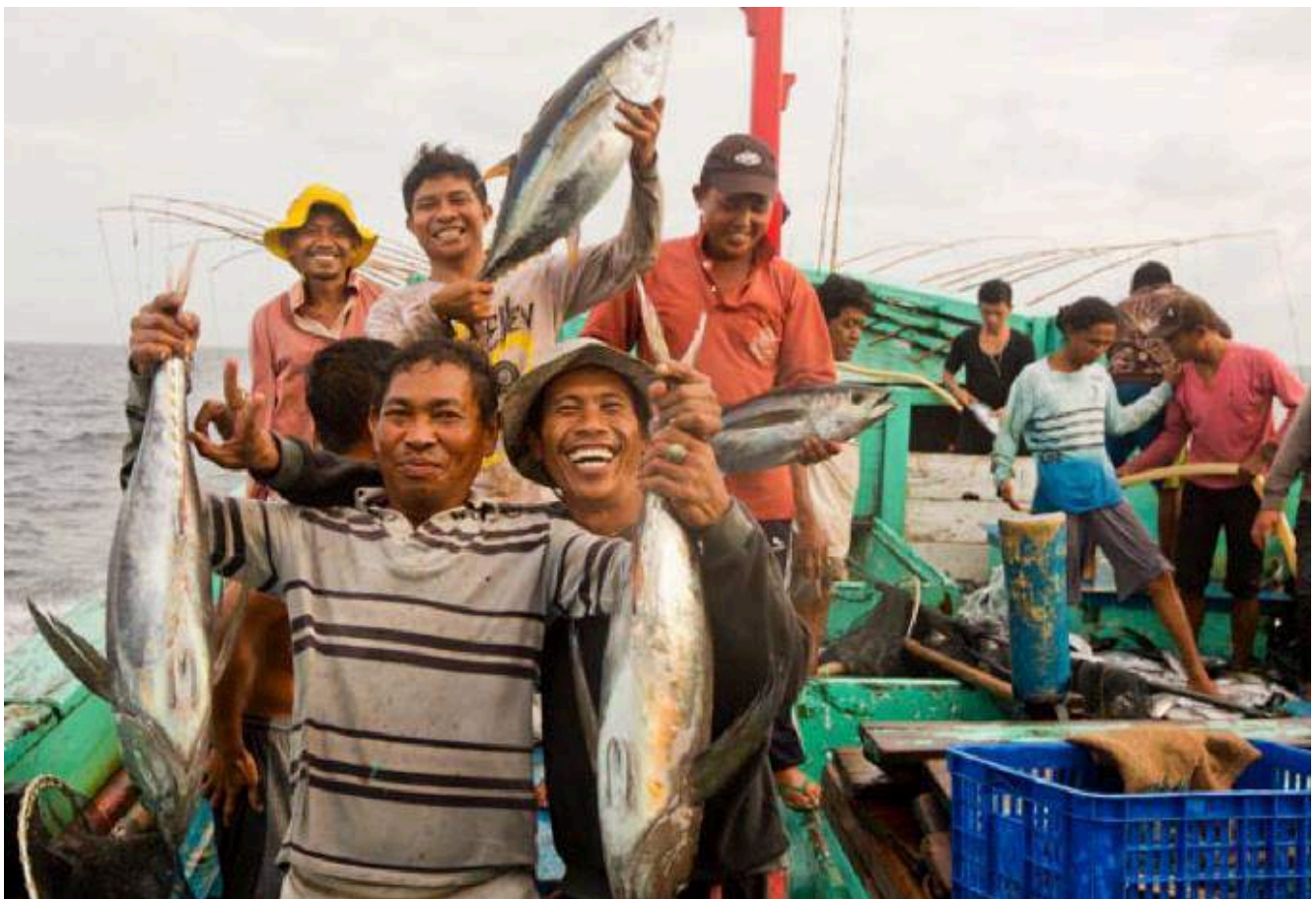
Pole-and-line fishers celebrate their catch, Bitung, Indonesia, 2015

This is because one-by-one tuna fisheries are people-centric; they support livelihoods in coastal communities throughout the world, providing jobs, nutrition, and a model to sustain tuna fisheries and the marine environment. For many coastal communities, one-by-one fishing methods provide an opportunity to develop a profitable and socially responsible domestic fishery sector, while supporting employment, food security, traditional cultures and livelihoods.