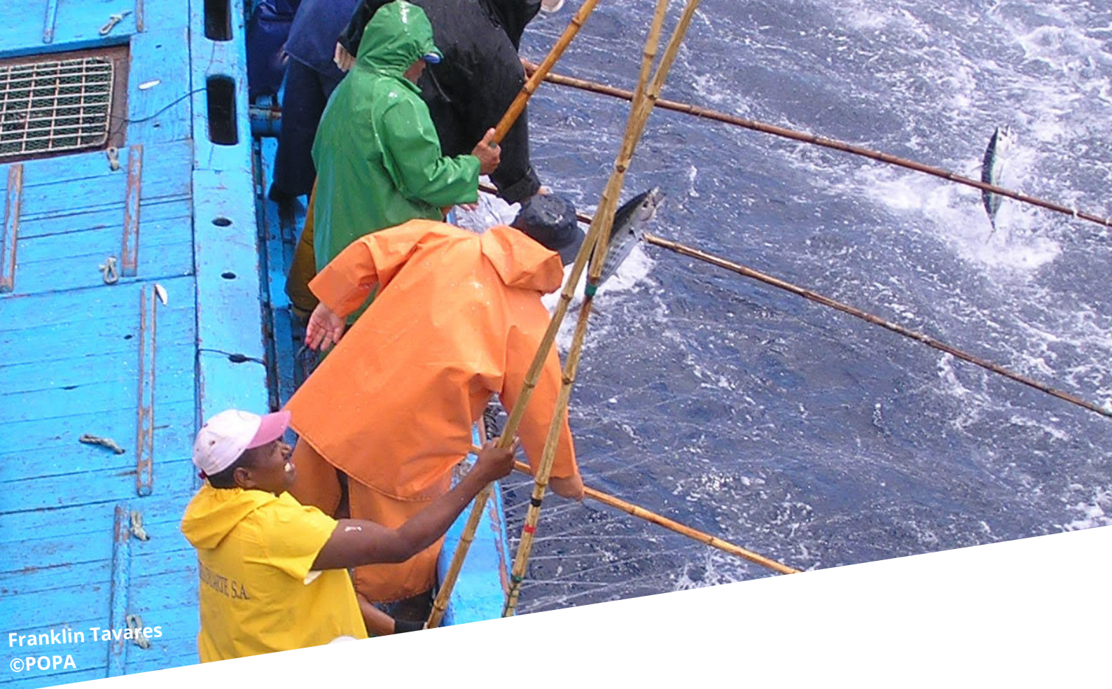
Franklin Tavares ©POPA